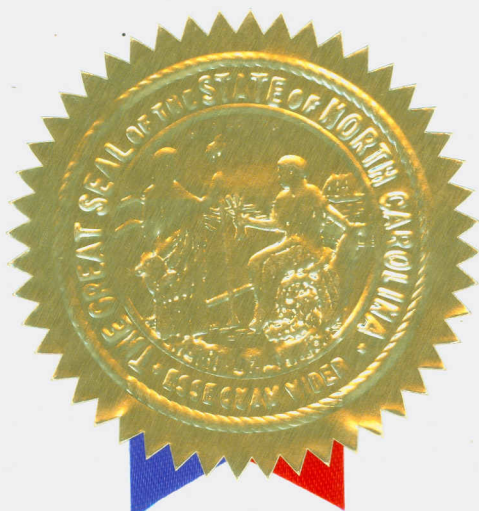
BEVERLY EAVES PERDUE

NOW, THEREFORE, I, BEVERLY EAVES PERDUE, Governor of the State of North Carolina, do hereby proclaim May 2012, as " MULTIPLE CHEMICAL SENSITIVITY AWARENESS MONTH " in North Carolina, and commend this observance to all our citizens.